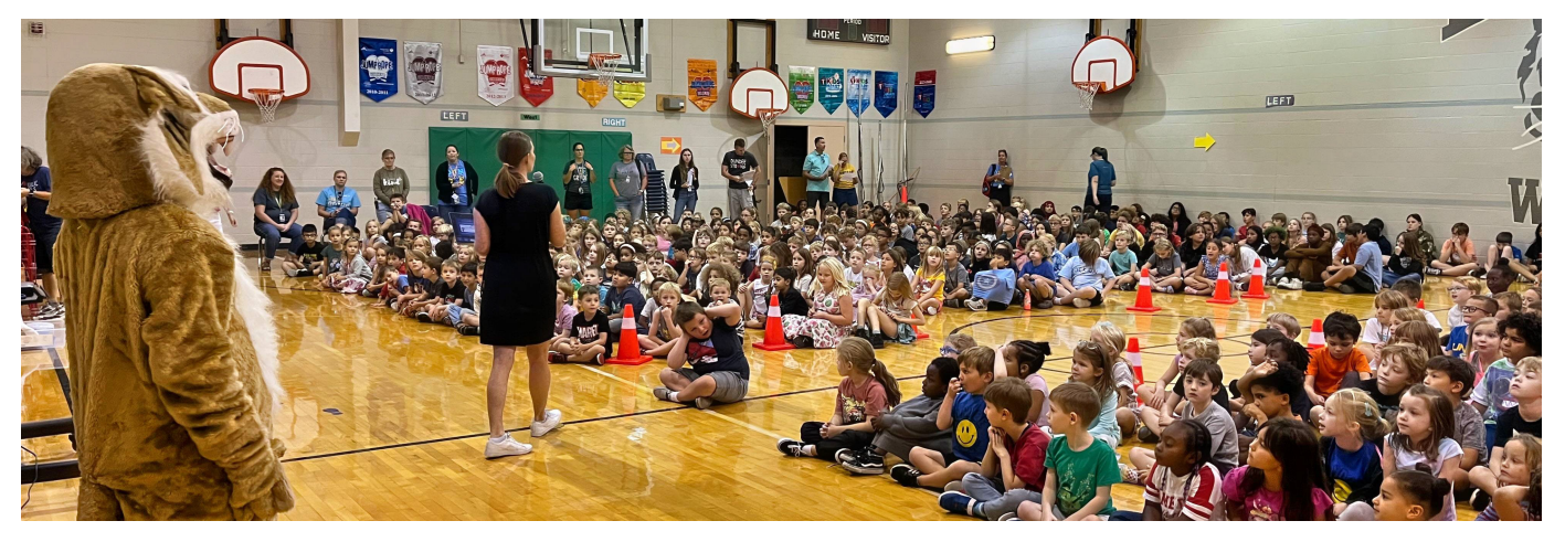
Dundee Wildcats displayed school spirit at a pep rally on September 14. The theme for this school year is "Learning is not a spectator sport. Get in the game!" The PTO welcomes you to contribute your time, talents and ideas. Visit www.dundeepto.org to get started.